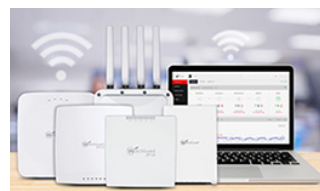
Secure Cloud Wi-Fi